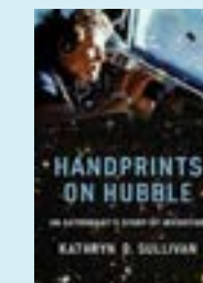
Handprints on Hubble Kathryn D. Sullivan