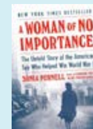
A Woman of No Importance Sonia Purnell