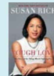
Tough Love Susan Rice