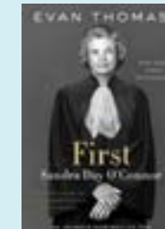
First: Sandra Day O'Connor Evan Thomas