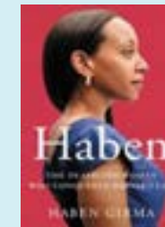
Haben: The Deafblind Woman Who Conquered Harvard Law Haben Girma