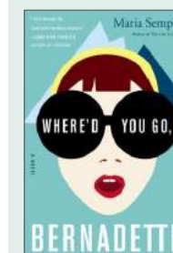
Where'd You Go, Bernadette Maria Semple