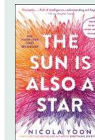
The Sun is Also a Star Nicola Yoon