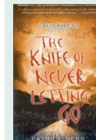
The Knife of Never Letting Go Patrick Ness