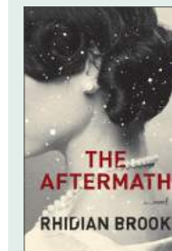
The Aftermath Rhidian Brook