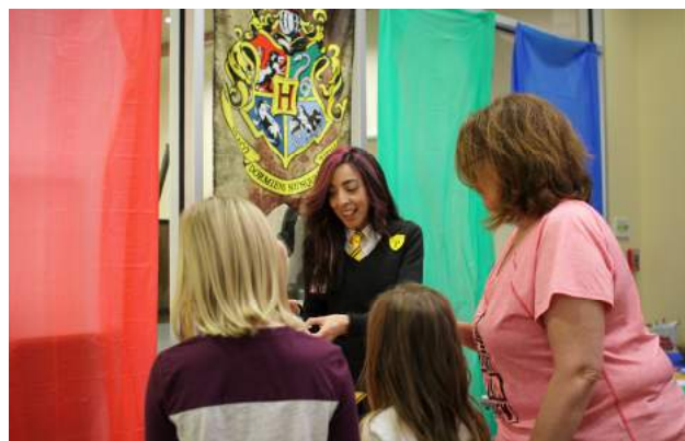
Over 100 people attended our fifth annual Harry Potter Book Night on February 7.

Prime Time Family Reading Time begins March 19 at the East Regional Library.